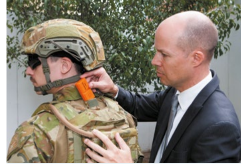
Successful innovations by small business: (left) Naval automated personnel tracking device (Blue Glue), and (right) satcom-on-the-move terminal (EM Solutions).