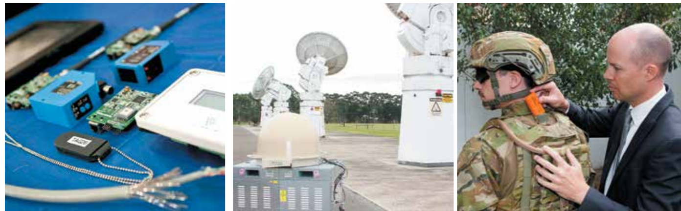
Successful innovations by small business. Left: Naval automated personnel tracking device (Blue Glue). Middle: Satcom-on-the-move terminal (EM Solutions). Right: Small business companies Myriota and IMeasureU will develop the Fight Recorder, a soldier-worn system to capture data from the battlefield.