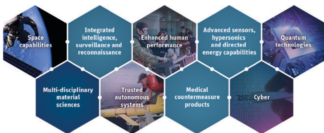
Next Generation Technology Fund priority areas

The Defence CRC program is administered by the Department of Defence and the Department of Industry, Innovation and Science. Information about the program guidelines, industry and researcher participant application can be found at www.business.gov.au/cdic .